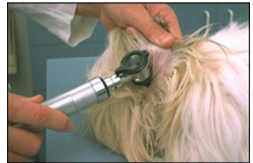
Otosopic exam of ear canal.

The results of the otoscopic and microscopic examination usually determine the diagnosis and course of treatment. If there is a foreign body, wax plug or parasite lodged in the ear canal, it will be removed. Some dogs must be sedated for this, or to allow a thorough ear flushing and cleaning. Microscopic study of debris from the ear canal helps determine which drug to use. Many dogs will have more than one type of infection present (e.g., a bacterium and a fungus, or two kinds of bacteria). This situation usually requires the use of multiple medications or a broad-spectrum medication.